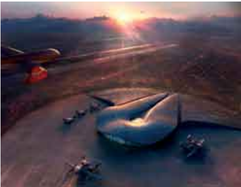
Top: Richard Branson's Spaceport America, designed by Norman Foster, will operate out of the desert in New Mexico.