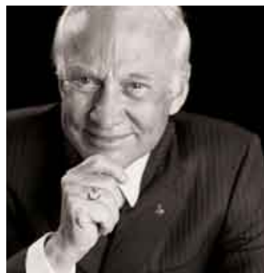
Above: Buzz Aldrin and the rest of the Apollo 11 crew set off on their historic journey; and Aldrin as he is today.